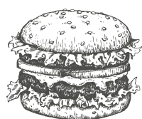
"NICE TO MEAT YOU"